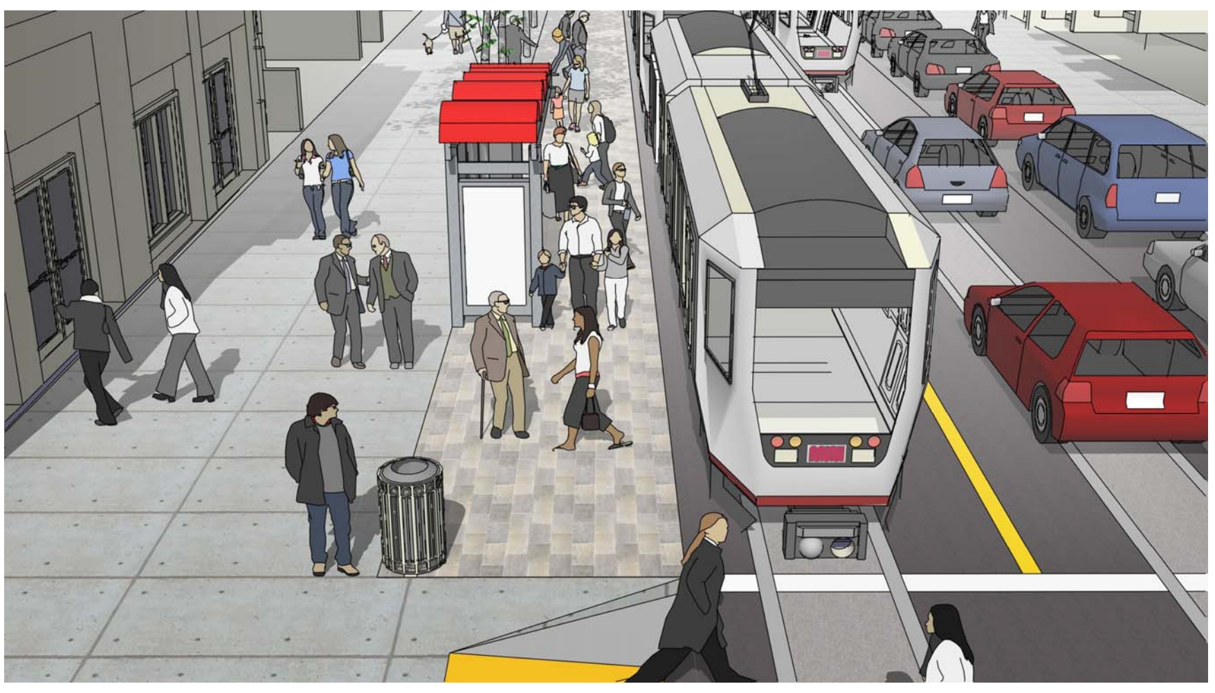
Rendering courtesy of San Francisco Planning Department, City Design Group.