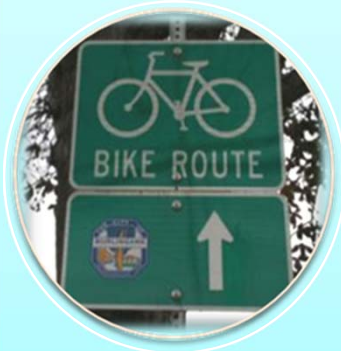
Bicycle Pedestrian Advisory Committee