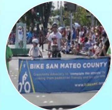
Bike San Mateo County