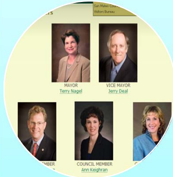
Burlingame City Council