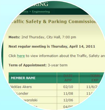
Traffic, Safety and Parking Commission